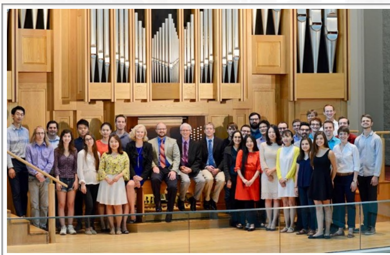
2017-2018 Indiana University Organ Department